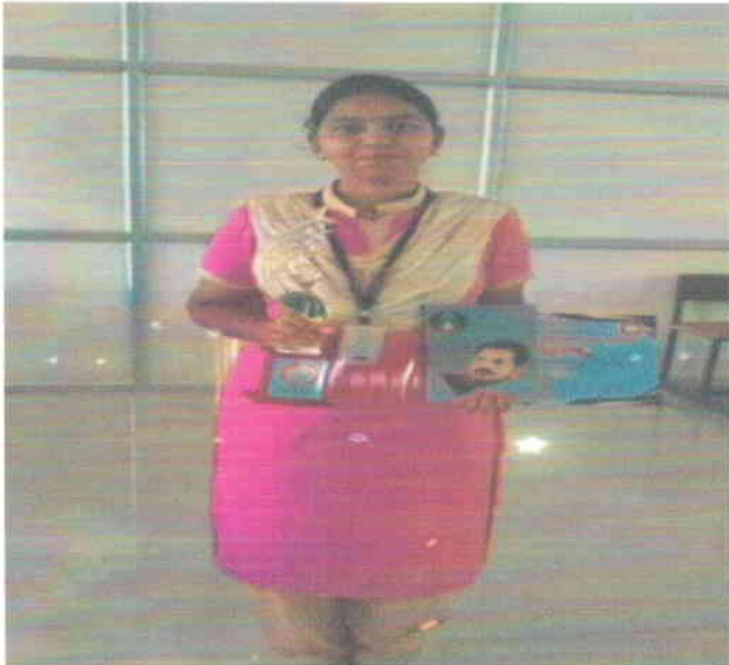
PRIZE GOT IN WORLD TIGER'S DAY COMPETITION